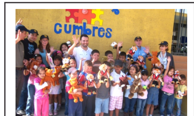
Danville/Sycamore Valley Rotary visits Monterrey Mexico and provides school supplies, toiletries, and stuffed animals to After School program which previously received a Matching Grant from club.

In 2010, Danville/Sycamore started working in partnership with a local non-profit, Asante Africa Foundation, to provide water well, upgrade classrooms, add enclosed outhouses, and electricity with solar panels in a small village in Kenya.