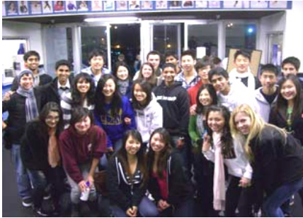
Interact Ice Skating Fundraiser. Danville/Sycamore Valley Rotary sponsors Interact Club at Dougherty Valley High School